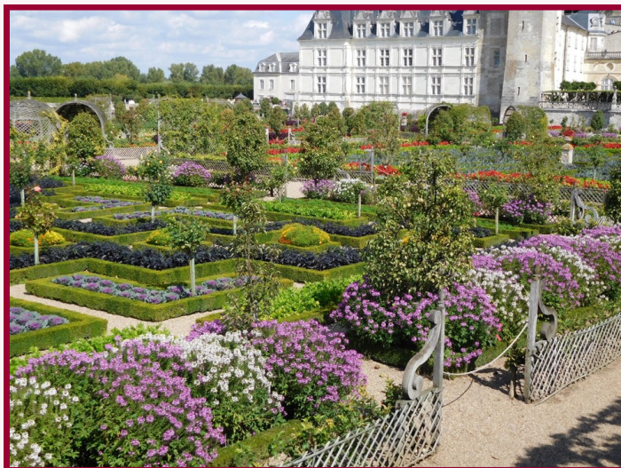
Part of the decorative vegetable garden with begonia border